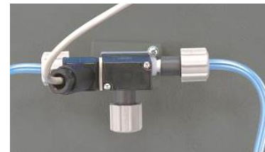
Figure 1, Switchover solenoid valve